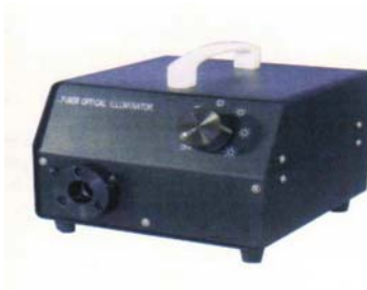
Fiberoptic Light Source