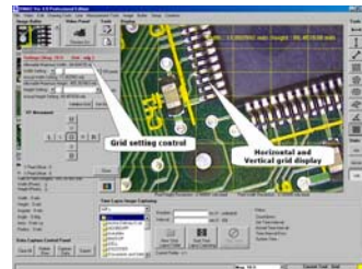
DIMAS Imaging System